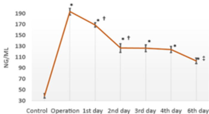
Figure 5. Dynamics of changes in the concentration of corticosterone in blood plasma in rats before and after the simulation of septoplasty. Note: * - significant differences between preoperative data (control) and postoperative data at p < 0.001 ; † - significant difference between postoperative follow-up periods at p < 0.001 ; ‡ - significant difference between postoperative follow-up periods at p < 0.01 .

The ratio of SDNN to rMSSD can characterize vagosympathetic balance and is quite consistent with LF/HF (the ratio of the low-frequency component to the high-frequency component of the HRV frequency spectrum or the vagosipathic index) [24]. Moreover, in the absence of differences in SDNN and rMSSD, SDNN/rMSSD may show a difference between study groups [24]. For example, if SDNN/RMSSD is an appropriate expression of LF/HF, higher SDNN/RMSSD, for example in fibromyalgia, compared with healthy controls, characterizes a shift in the balance of the ANS towards the sympathetic component, which is consistent with other studies [25, 26]. Changes in SDNN/rMSSD confirm the idea that on the first day after septoplasty modeling in rats, disadaptation reactions develop, which are manifested by an increase in the activity of the parasympathetic nervous system against the background of an increase in corticosterone, as well as a decrease in the activity of rats in the open field [4, 6], and in the subsequent postoperative period, the body's response to surgical stress is characterized by an increase in the activity of the sympathetic nervous system with an increase in total power in the period 2-4 days, with a peak on the third day, which coincides with the maximum changes in the cytoarchitecture of the pyramidal layer of the hippocampus in almost all of its subfields [7-9], as well as with the formation of a "plateau" on the graph of corticosterone concentration (Fig. 5).