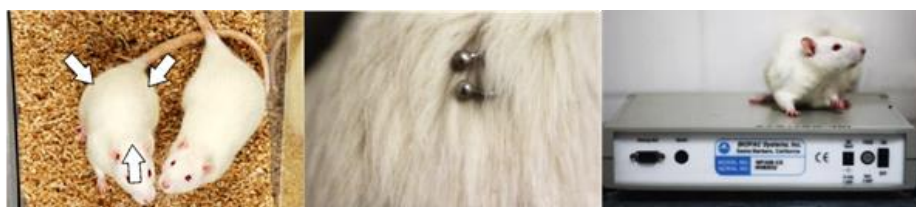
Figure 2. Scheme of applying (a) piercing (b) in rats for recording ECG on a Biopac M30-B polygraph (California, USA) (c).

Two days before the surgical intervention, all rats, under general anesthesia with a solution of Zoletil 100, were sutured with metal half-rings with capitate ends in three places - two in the back and one in the withers (Fig. 2 a, b). On the day of surgery, before the intervention itself, a control ECG recording was performed for 15 minutes on a Biopac M30-B research polygraph (California, USA). At the same time, the rats were in a free state. After the operation, the ECG was also recorded for 15 minutes daily for 6 days.