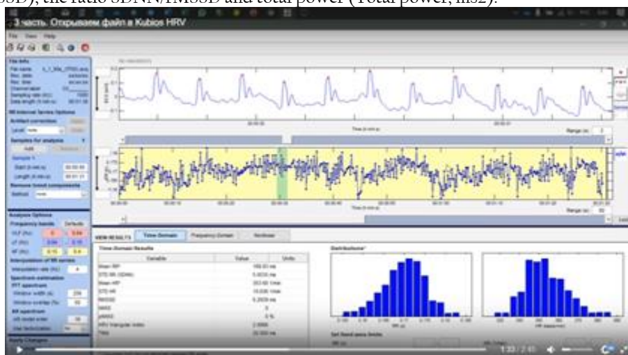
Figure 3. Example of ECG data processing in Kubios HRV.

Next, heart rate variability was analyzed according to R.M. Baevsky [11] in the Kubios HRV program (Fig. 3). Among the parameters of the HRV temporal spectrum, the following were studied: the standard deviation of R-R intervals (SDNN) between normal QRS complexes, the square root of the sum of squares of the difference in the values of successive pairs of normal R-R intervals (rMSSD), the ratio SDNN/rMSSD and total power (Total power, ms 2 ).